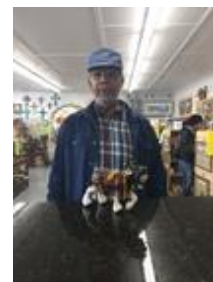
A happy customer!