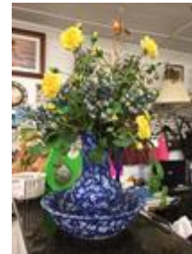
Beautiful Pitcher and bowl