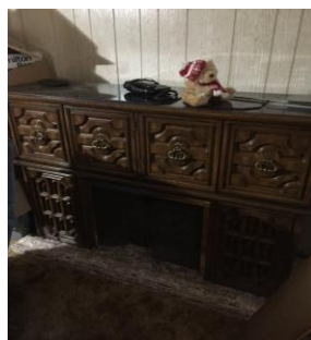
70's Entertainment Center