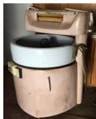
Vintage 50's Kenmore Wringer Washer