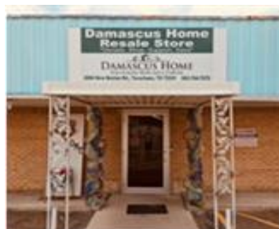
Damascu Home Resale Store

Find the Resale Store on Facebook @DamascusHomeResaleStore